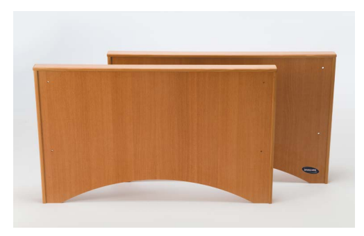
Select design for Medley Ergo

Adjustable height range for Medley Ergo Low 210-610mm or 280-680mm.