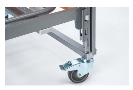
Double height positions for bed ends

Can be adjusted in both height and depth (optional).