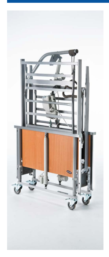
Easy to transport

All Medley Ergo beds are easy to assemble and dismantle and can be transported using transporter kits (optional).